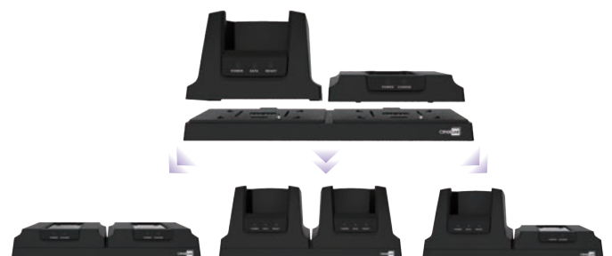
Modular Charging and Communication System

The 8600 series' flexible design comes with swappable keypads which give the 8600 series the power to easily swap between 29 or 39 keys when it is necessary. The 8600 series also comes equipped with a modular system which provides various combinations of charging / communication cradles and battery chargers. This makes the initial configuration modification very simple. This flexible design will also assist in reducing the inventory level while providing more cost-effective re-configurations for end users. Additionally, it will also make repair and replacement process easier and quicker.